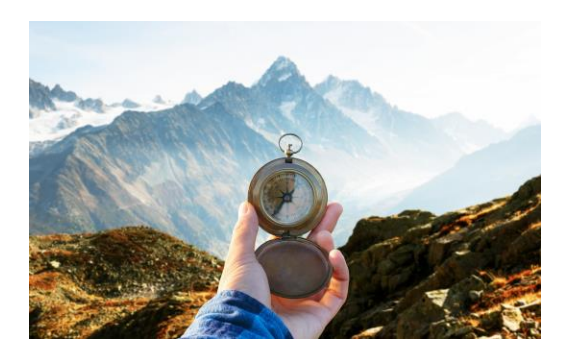
Are your executives on the right path to realize their potential?